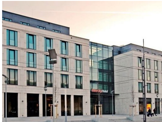
Hotel- Bürokomplex Wiener Platz, Dresden