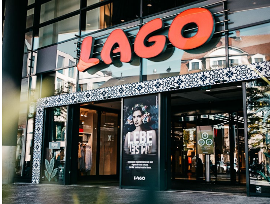
LAGO Shopping Center, Konstanz