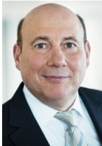
Head of Legal & Insurance