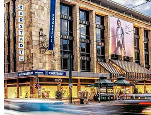
Kaufhaus Karstadt, Düsseldorf