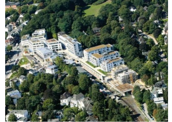
Quartier Blankenese Bahnhofplatz, Hamburg