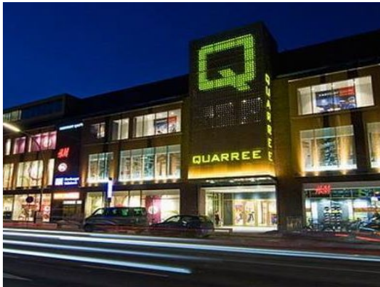
QUARREE Wandsbek, Hamburg