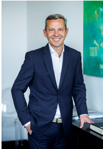
Head of Center Management