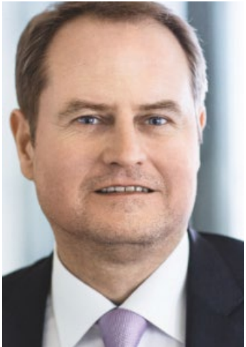
Head of Leasing