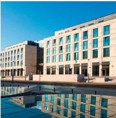
Intercity Hotel, Dresden