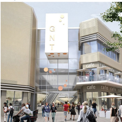
Neustädter Tor, Gießen

Our project managers, engineers and architects work out visions for the planned objects together with the customer and provide support during the entire implementation period. From the basic idea to the completion, the professional and project-strong joint venture team accompanies you.