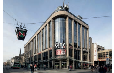
City Point, Bochum