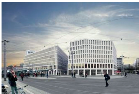
City Gate, Bremen