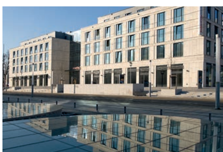
Wiener Platz, Dresden