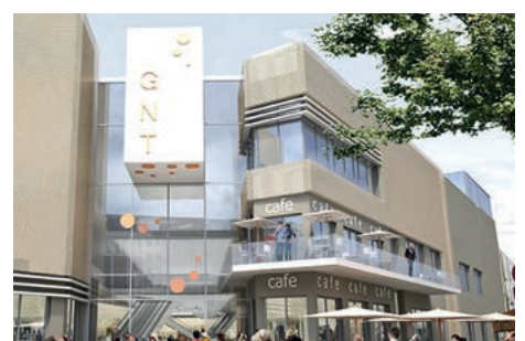
Gallery Neustädter Tor, Gießen