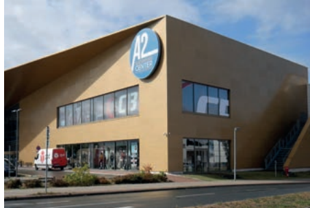
A2 Shopping Center, Hanover