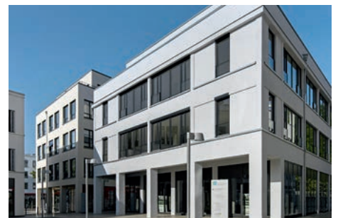
Blankenese Bahnhofplatz Quartier, Hamburg